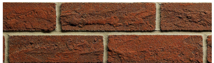
Sample Texture / Colour - Red Shadow